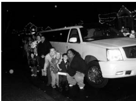
Families were given a sparkling treat by Sunshine Limo Holiday Light Tours . The parents and children were so excited to ride in beautiful limousines to view the holiday lights - hot chocolate and candy canes for all!

Because of You "Thank you so much for all of the wonderful gifts you sent to me and my family. I hope to someday be able to bring as much joy to another family as you have done for us. Thank you!" Relief Nursery Parent